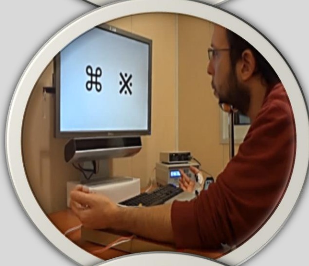
BIOPAC Electrophysiological Data Acquisition & iView X Eye Tracking System