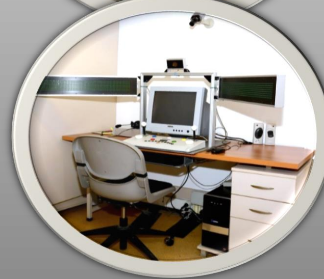
Vienna and CogniPlus Test System