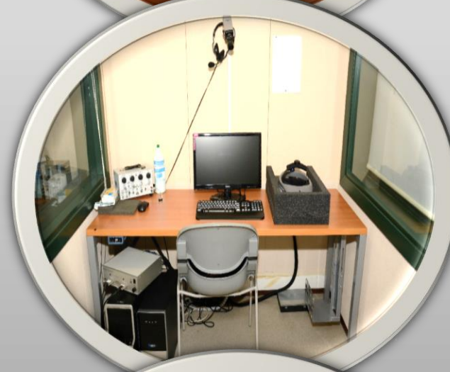
NVIS Virtual Reality System