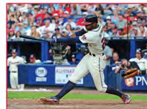
ATLANTA BRAVES BASEBALL

NONSTOP FLIGHTS TO MORE THAN 150 U.S. DESTINATIONS INCLUDING MIAMI, NEW YORK CITY, AND WASHINGTON, D.C.