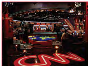
CNN WORLD HEADQUARTERS

NON-STOP FLIGHTS FROM ISTANBUL TO ATLANTA AND EXCITING ATTRACTIONS, SUCH AS . . .