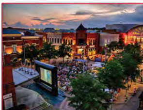
FANTASTIC SHOPPING CENTERS