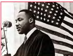
MARTIN LUTHER KING, JR. SITE