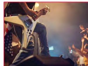
FESTIVALS & CONCERTS