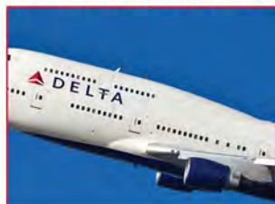
DELTA AIR LINES HEADQUARTERS