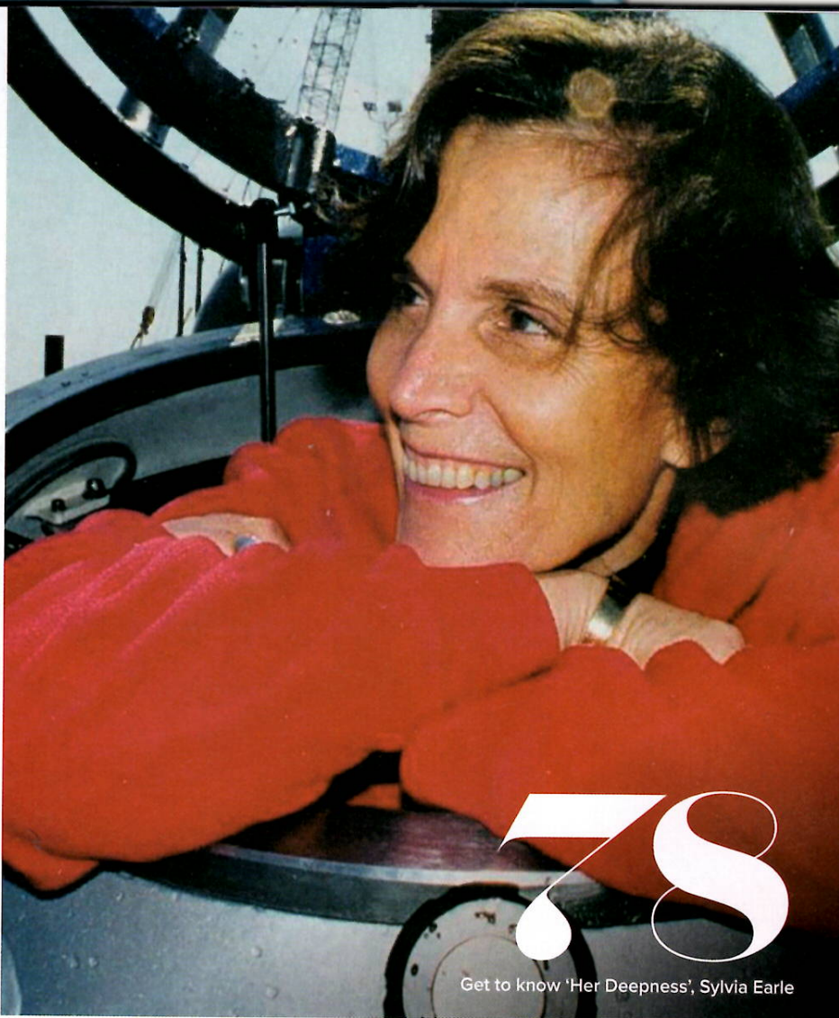
Get to know 'Her Deepness', Sylvia Earle

A special interview with the legendary American marine biologist Sylvia Earle