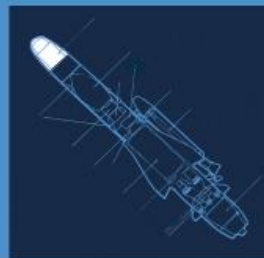
Industry and research